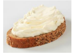
Soft/ cream cheese e.g. Philadelphia, supermarket branded cream cheese, cottage cheese