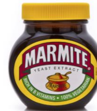
Yeast extracts e.g. Marmite