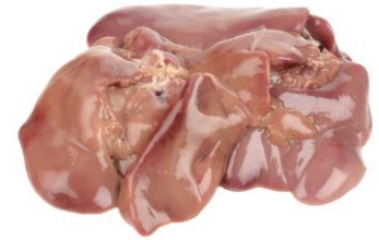
Offal e.g. Liver & Kidney