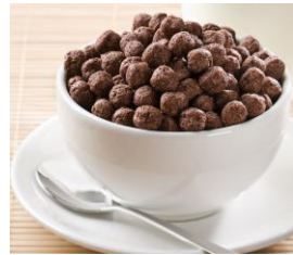
Cereals containing bran, nuts or chocolate e.g. muesli, Branflakes & All Bran