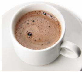
Hot chocolate, milky drinks, malted drinks e.g. Horlicks & Ovaltine