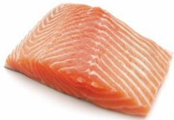
White fish, fish fingers, tuna & salmon