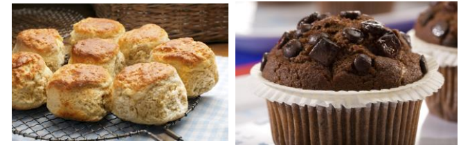
Scones & chocolate muffins / cake (Foods containing baking powder)