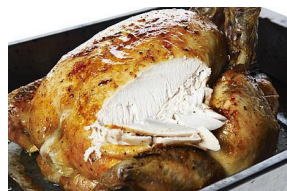
Meat e.g. beef, chicken, lamb, pork & turkey