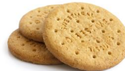
Plain biscuits e.g. Rich Tea, Digestive, shortbread, Jammy Dodgers, Custard Creams. Marshmallows, doughnuts, jam tarts, boiled sweets, mints, jelly sweets