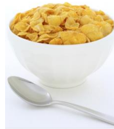
Cereal not containing bran, chocolate or nuts e.g. Cornflakes, Rice Krispies, porridge oats, Special K