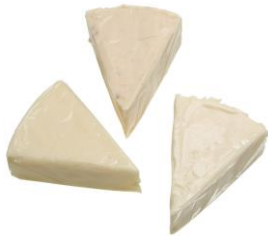
Processed cheese e.g. Diarylea, Laughing Cow