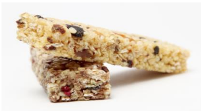
Cereal bars containing nuts and chocolate