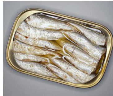
Tinned fish with edible bones (e.g. Sardines & Pilchards)